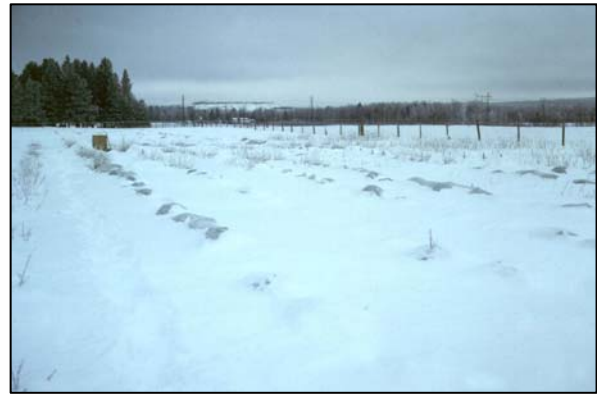
Figure 2. Overwintering half-high blueberries under a floating row cover in Minnesota.

Preventing desiccation by using windbreaks can also help minimize winter damage. Some growers use a floating row cover over half-high blueberries to increase survival in cold climates ( Figure 2 ). Excessive nitrogen fertilizer or late applications can make plants susceptible to cold temperatures too. Balanced nutrition, determined with a foliar analysis, will help ensure that plants have the capacity to harden properly as winter approaches.