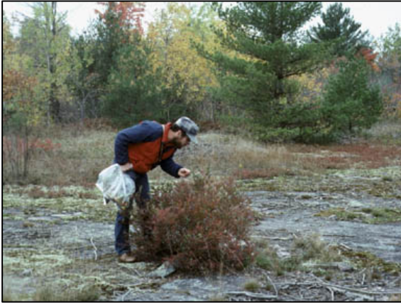
Figure 1. This blueberry plant appears to be a natural hybrid between lowbush ( Vaccinium angustifolium ) and highbush ( V. corymbosum ) blueberry and is growing in the Adirondack Mountains in a very cold region of New York State.

Woody plants growing in cold climates often have many of the same adaptations as desert plants (thick leaves, narrow vessels, small stomata, ability to store salt in leaves), because the fundamental problem in both climates is the lack of water. In the desert it does not rain; in cold climates during winter, the soil water is in the form of ice and the air is exceptionally