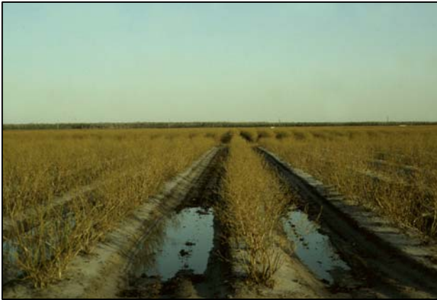
Figure 3. Raised beds help prevent stunting and disease development in wet sites.

It is unusual for a mature blueberry plant to die suddenly from cold temperature injury; the decline is most often gradual. First, shoot growth is reduced and, as a result, a low number of floral buds are produced on the shoots. Since the floral buds are formed at the tips of shoots, and winter injury always starts at the tips and works down, the first buds to die are flower buds. Vegetative buds are hardier than floral buds. Blueberries growing in cold climates may exhibit reasonable vegetative growth, but little fruiting. Winter-injured blueberry plants are