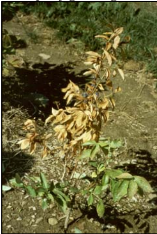
Figure 5 (left). Vascular collapse of an entire cane on a young plant infected with Phomopsis canker.

A second level of winter injury occurs when plants appear to be healthy in spring, but shoots suddenly collapse and die when the weather warms significantly. Although Phomopsis canker can cause these symptoms ( Figure 5 ), they also may be due to vascular collapse as previously injured vascular tissue is unable to support the rapidly growing shoot.